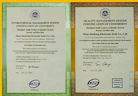
Certificate of ISO14001 environment management system